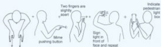
A pelican crossing is a