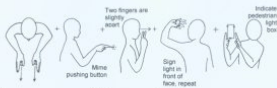
A Pelican Crossing